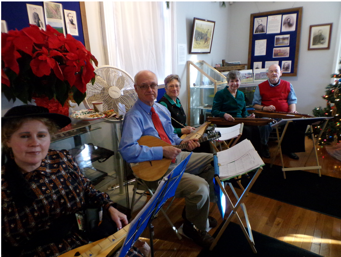
The Wilderness Run Players at the Graffiti House

The Brandy Station Foundation is pleased to resume its Holiday Open House again this year on December 3rd at the Graffiti House, 19484 Brandy Road, Brandy Station. The hours are 1-4PM. The Open House will feature the dulcimer