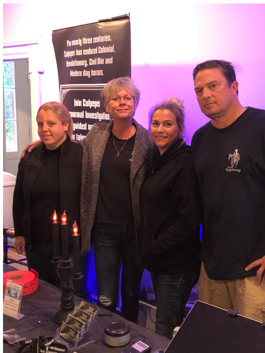
Culpeper Paranormal at the Spirits of the Graffiti House